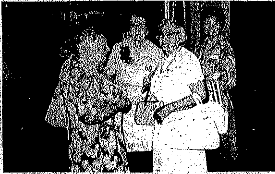
ALUMNI '75 - LADIES REMEMBERING THE 'GOOD OLD DAYS'.