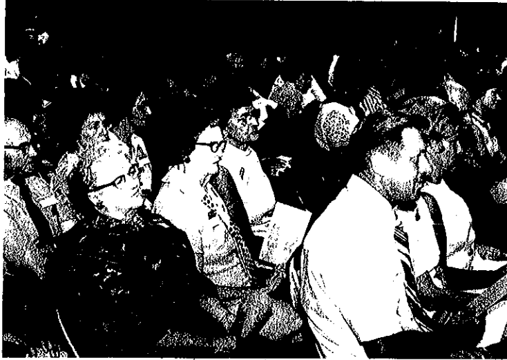
A view of the crowd in the audience during the program.

All of these honored classes had a group picture taken and these are printed in this newspaper.